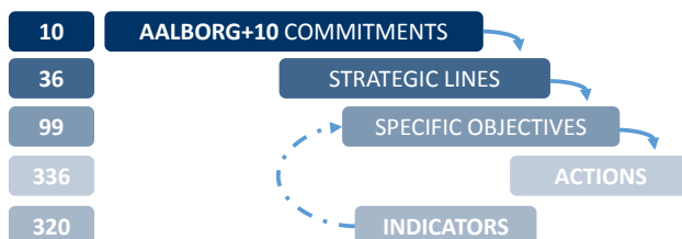
Outline of the Bizkaia 21 Programme (2011-2016)