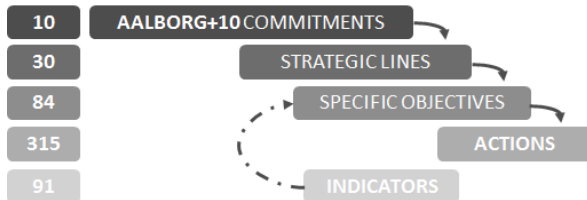
Outline of the Bizkaia 21 Programme (2005-2010)

The definitive document was structured along strategic lines based on each of the 10 Aalborg Commitments. Each of these comprised a series of specific objectives, which in turn were made up of a series of specific actions along with a deadline for achieving them, a success monitoring indicator, and a duty on one or various Departments.